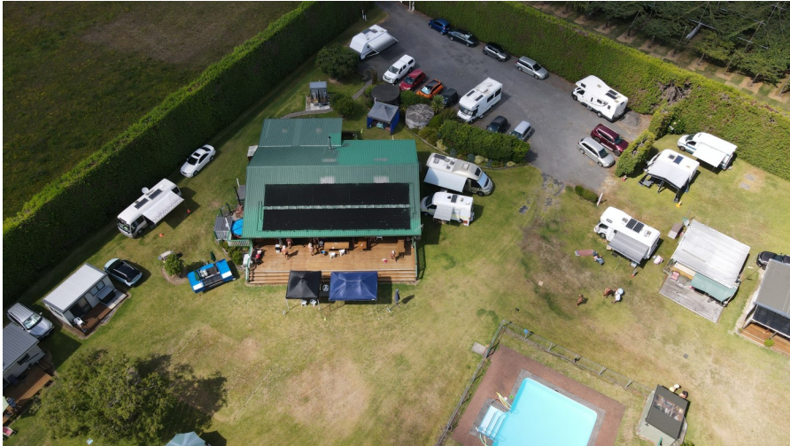
Waikato Outdoor Society: Woodside Naturist Park 50A Trentham Road, Tamahere, Hamilton RD4 3284